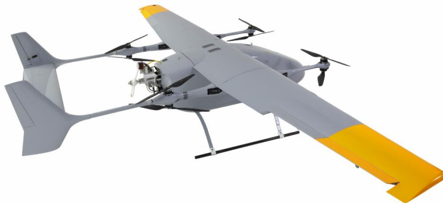
Figure 1. Example Quad Plane VTOL UAV – Spectre Solutions Chimera [1]

Recent years have seen a notable increase in the popularity of contemporary eVTOL aircraft, both in academic and commercial contexts. However, the high energy consumption of vertical propulsion systems represents a significant challenge. Insufficient energy density of batteries on the market hinders the endurance of vertical flying aircraft, therefore a need for energy-optimal solutions arises. It is postulated that optimizing the trajectory of the transition phase is a viable option in mitigating the above shortcomings. The transition of a VTOL aircraft consist of accelerating from hovering to forward flight, at which point the full lift force is provided by the wings, instead of the vertical propulsion.